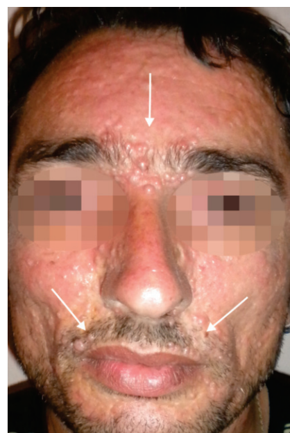
FIGURE 3: Son with multiple small elevated lesions over his forehead and nasolabial areas