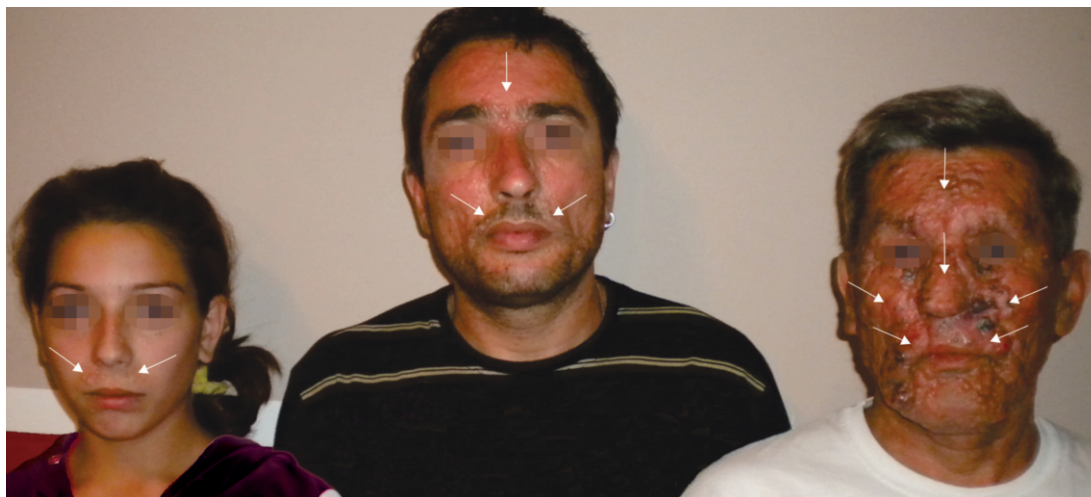
FIGURE 1: Family (right - father, middle - son and left - granddaughter) with segmental bilateral neurofibromatosis on the face

Their lesions had developed since early childhood. Surgical treatment was applied to both father