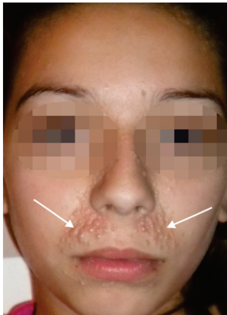
FIGURE 4: Granddaughter with lesions over her nasolabial areas