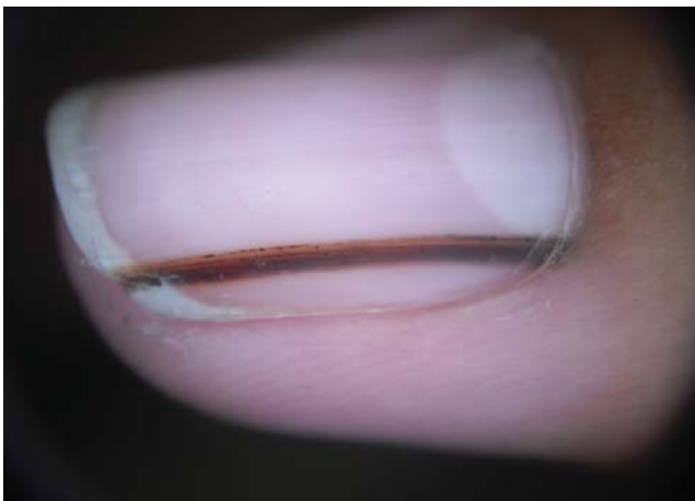
FIGURE 2: Dermatoscopic examination of the patient's longitudinal melanonychia

angular shape (Figure 2). Ungual matrix biopsy was performed by shaving. Histopathology was compatible with melanoma in situ (Figure 3). Surgical management involved excision of unguinal apparatus up to periosteal region. Following histopathology no neoplasm showed in the 40 cuts made. Clinical staging was TisN0M0 (Stage 0). Patient followed up for 11 months without recurrence (Figure 4).