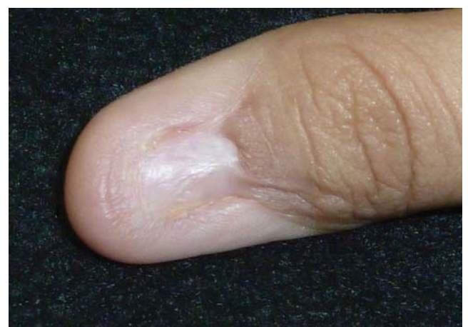
FIGURE 4: Clinical appearance after eleven months of follow-up without signs of recurrence