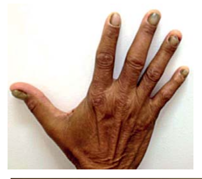
FIGURE 3: Nails yellowed and dystrophic, curved and without lunula and cuticle (right hand)