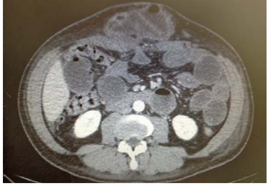
FIGURE 4: CT scan of abdomen, axial plane. Umbilical hernia with extrusion of small intestine loops to subcutaneous tissue; accumulation of fluid intermingling with handles

FIGURE 3: Nails yellowed and dystrophic, curved and without lunula and cuticle (right hand)