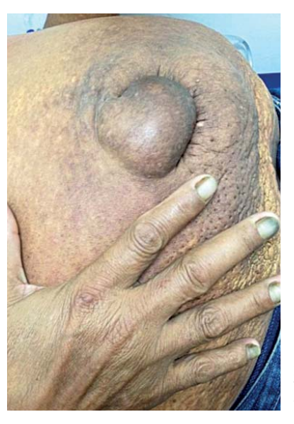
FIGURE 1: Marked bulging in the umbilical region

The abdomen CT scan revealed a 0.9 cm hernia ring in the umbilical area, with intestinal content as a component of this hernia (Figures 4 e 5).