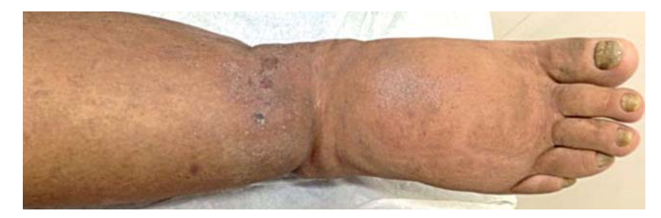
FIGURE 2: Right foot nails yellowed and dystrophic. Notice the absence of cuticle and lunula