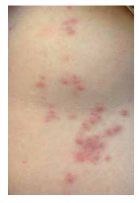
FIGURE 1: Multiple papules of vellowish color

The lesions are formed when eggs or worms migrate, by means of a still unknown mechanism, causing the onset of granulomas on the skin and mucosae. They are usually found in the genital and groin areas and more rarely in the extragenital region (mainly