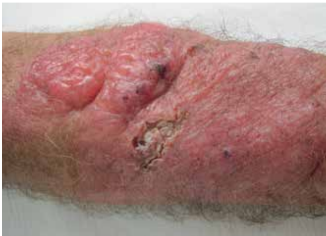
FIGURE 1: Erythematous plaque with multiple soft and friable nodules

Serology for HIV, serum immunoglobulins (IgG, IgM, and IgA), protein electrophoresis, blood count, biochemical tests, and