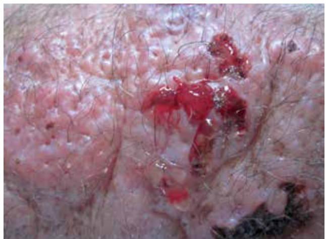
FIGURE 3: Gelatinous secretion