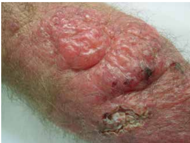
FIGURE 2: Details of the nodules