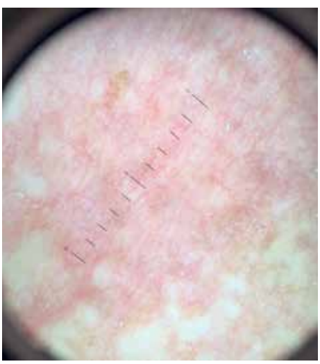
FIGURE 2: Linear vessels on dermoscopy