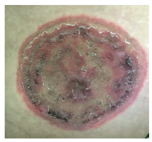
FIGURE 1: Round plaque with well-defined borders and figurate center

The dermatophytes comprise 3 genera of fungi capable of invading keratinized tissues: Trichophyton, Microsporum, Epidermo