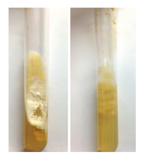
FIGURE 2: White, wooly colony with yolk-yellow reverse