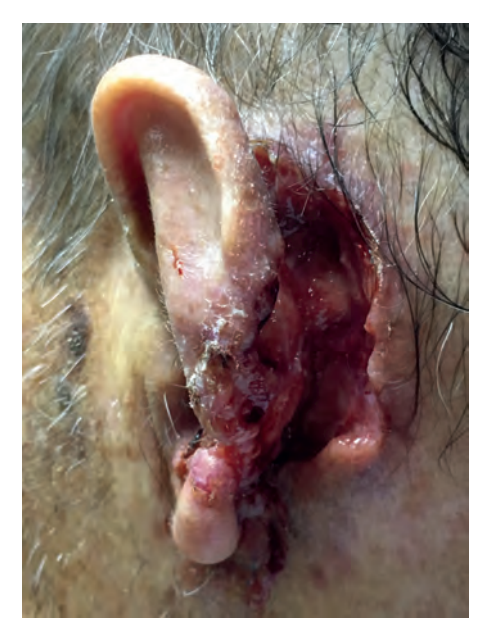
FIGURE 1: Tumor compromising concha, tragus, helix, posterior auricle

An 84-year-old man presented to our clinic with a 5-year history of an ulcerated tumor arising from his left retroauricular region, with local destruction of the auricle (Figures 1 and 2). One year before, a biopsy performed at another institution reported it as a sclerodermiform basal cell carcinoma with squamous differentiation. A new biopsy was performed, identifying a multilobular