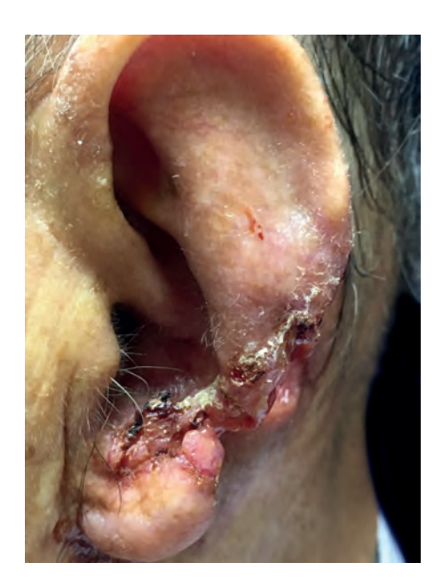
FIGURE 2: Ulcerated and infiltrating tumor with local destruction of auricular tissue

Malignant hair follicle tumors account for 1% of adnexal carcinomas. Prior to 2014, a total of 103 cases of TC had been reported; 60% of these cases occurred in men, 51% involved the face, and the average age of the patients was 72.5 years. Although the pathogenesis remains unclear, documented risk factors are ultraviolet radiation, solid organ transplant, immunosuppression, scars, burns, and genetic diseases like xeroderma pigmentosum and Cowden disease. TC may also develop on seborrheic keratosis, nevus sebaceous, discoid lupus scarring and tuberculosis verrucosa cutis. 1.3.7.8