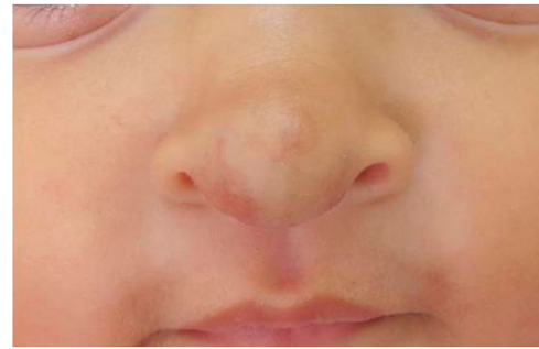
Figure 3 After the treatment with oral propranolol, 9-month-old infant.

The infants developed none of the reported side effects – sleep disturbances, hypoglycemia or hypotension – and