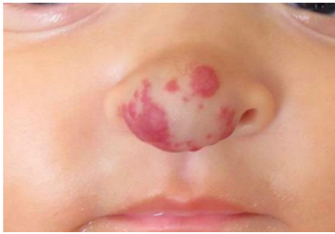
Figure 1 Before the treatment with oral propranolol, 6-month-old infant.