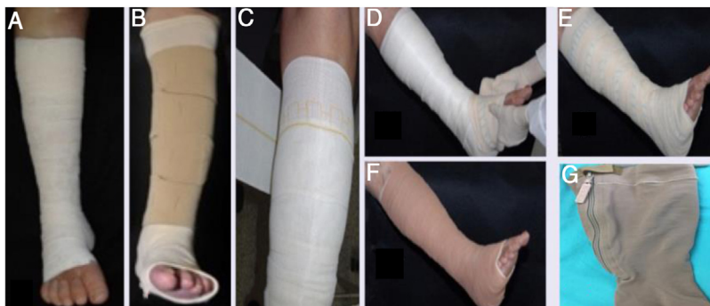
Figure 1 (A), Unna's boot; (B), velcro system; (C), elastic band (single layer); (D–F), multilayered compression; (G), high compression elastic stocking, with zipper.