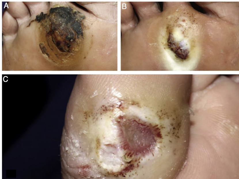
Figure 2 (A), hyperkeratosis and hematic crusts on the forefoot; (B), after cleaning, granular and hyperkeratotic ulcer; (C), ulcer with callous edges on the hallux.

disorders such as familial amyloidosis, and familial ulcerative-mutilating acropathy (Thevenard syndrome), among others. 27,28