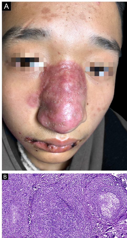
Figure 2 (A), The red plaques enlarged and involved almost the whole nasal dorsum when the patient visited again; (B), The histopathology of the second biopsy showed a similar histological profile as the first biopsy (Hematoxylin & eosin, \times 200 ).

tis. Unfortunately, the authors didn't diagnose in time and prevent the infection from rapidly worsening.