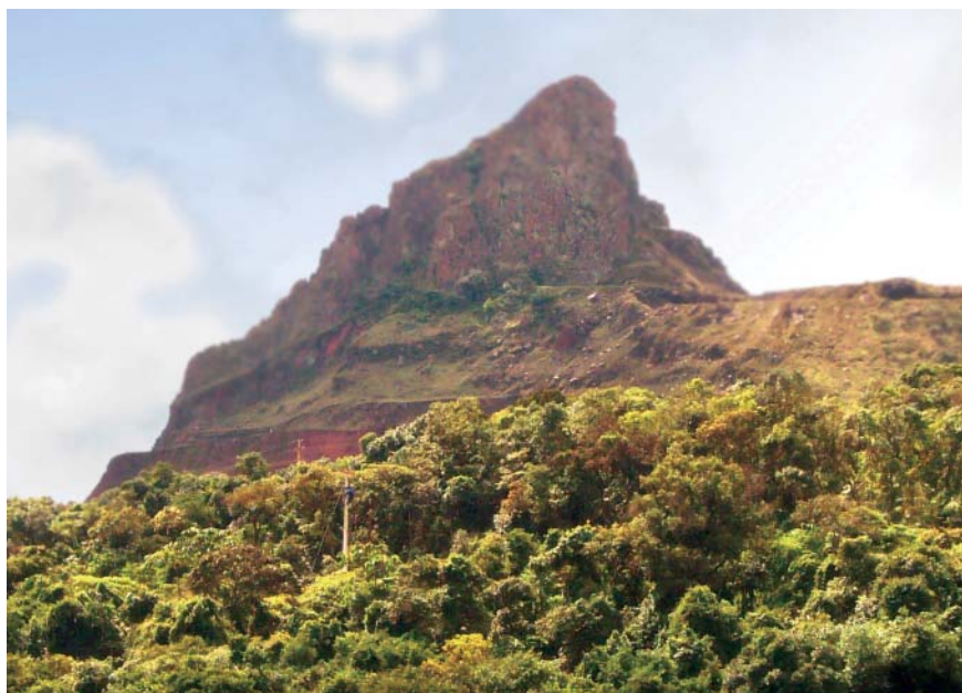
Figure 3 - The iron ore peak of Itabira do Campo seen from the southwest at a distance of 180 metres.

With the present means of transportation, or with those that are likely to exist in the near future, the greater part of these deposits must be regarded as inaccessible. The exceptions are those situated along the river São Francisco in the state of Bahia and near the banks of the river Paraguay in Matto Grosso . The former can be reached by 575 kilometres of railway from the port of Bahia to Joazeiro and by a certain amount of river transportation up stream from that point, and also by 1010 kilometres of railway from the port of Rio de Janeiro to Pirapora and down stream navigation from that point. The Matto Grosso ore deposits,