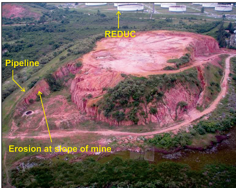
Figure 4 Grit extraction in the Duque de Caxias County (Rio de Janeiro State), close to the gas pipeline track Japeri-REDUC. The mining works extended to the boundary of pipeline track.