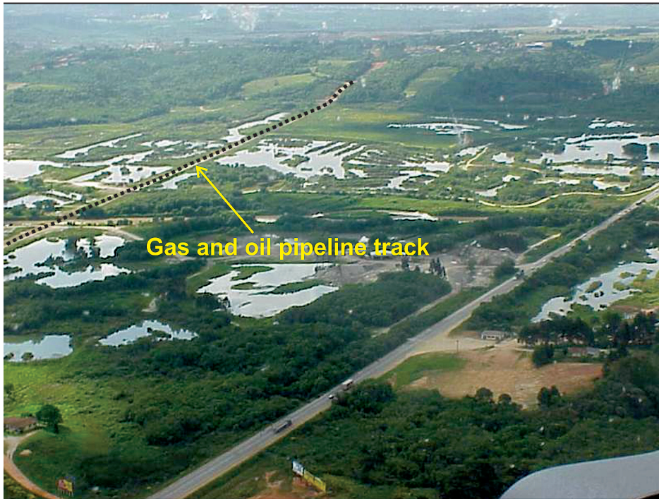
Figure 3 Sand dredging from submersed pits on the floodplain of the Iguaçu River, Curitiba County (Paraná State), that isolate the gas pipeline track Bolívia-Brasil (GASBOL).

tivities along the pipeline tracks, and can cause environmental disturbances along the strips. In the case of open-pit mining, the advance of the extraction fronts in the direction of the gas pipeline tracks should be considered in a way to inhibit the mining activities in the bordering areas, since these areas could serve as destabilization points of the neighboring slopes, thus preventing the installation or acceleration of erosive processes that could affect the pipelines (Figure 4).