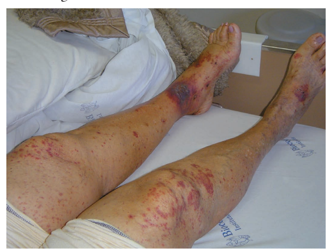
Figure 1 - Purpura and necrotic skin ulcer in a patient with Henoch-Schönlein Purpura (Patient 5).

Eleven patients, two male and nine female, age (mean \pm standard deviation [SD]) 39.5 \pm 20.1 years-old (median 30 years-old) were studied. Clinically, nine patients (81%) presented purpura, in two of them with necrotic skin ulcers. (Figure 1) Sixty-four percent of the patients presented arthritis, mainly in knees and ankles. Ten patients (91%) presented GN, in three of them as a rapid progressive GN with renal insufficiency and in two of them with nephrotic range proteinuria. Four patients (36%) had gastrointestinal (GI) involvement clinically expressed as abdominal pain and bloody diarrhea. Only one patient reported prodromic infection. Vasculitis related symptoms were present for (mean \pm SD) 13.1 \pm 17.2 months (median 6 months) before diagnosis.