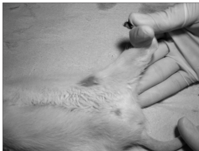
Figure 1. Positioning the animal to receive treatment with hip inflexion, knee extension and ankle dorsiflexion.

For the results related to PET, the SG showed a significant increase after the lesion (M2) compared to the moment before the lesion (M1), and this increase continued at every appraised moment. When comparing the post-lesion value (M2) to the subsequent moments (M3, M4 and M5), there was significant PET decrease, suggesting the persistence of pain (Figure 2). For the STCG, as in the SG, there was significant PET increase when comparing the moment before the lesion (M1) to the subsequent ones (M2, M3, M4 and M5). In contrast, when comparing the moment after lesion (M2) with the subsequent ones,