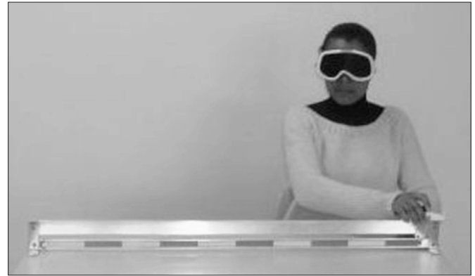
Figure 1. Photo of an individual, wearing opaque goggles, and the linear positioning apparatus.

Participants were assigned to either the self-control or yoked groups in a quasi-random order. Specifically, they were assigned to groups based on the chronological order of their appointment for participation, but were yoked male-to-male and female-to-female, with 7 men and 8 women in each group. Participants were informed about the goal of the task in simple language. They were asked to sit in a comfortable