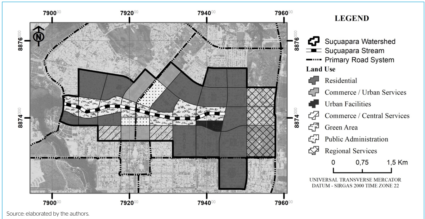
Figure 1 - Land use distribution of Suçuapara Watershed.