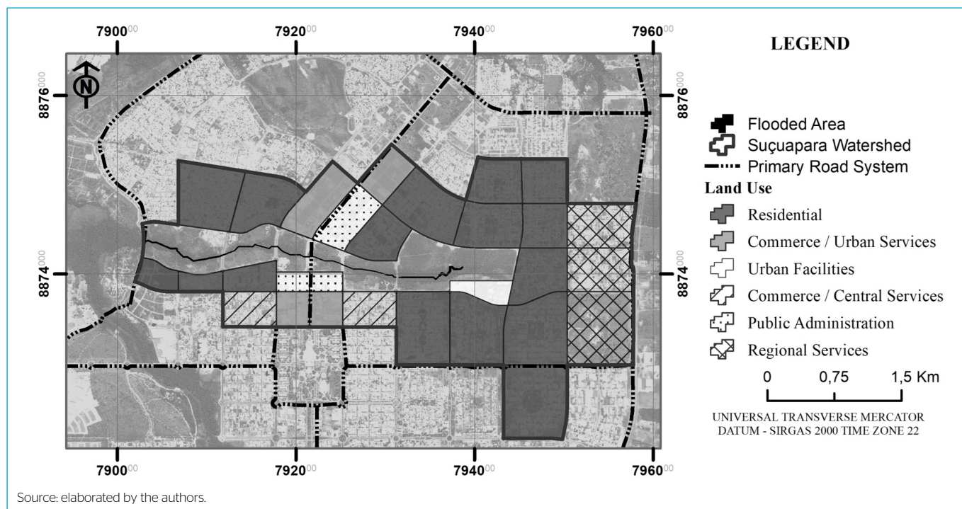
Figure 4 - Flooded Area on Suçupara Watershed.