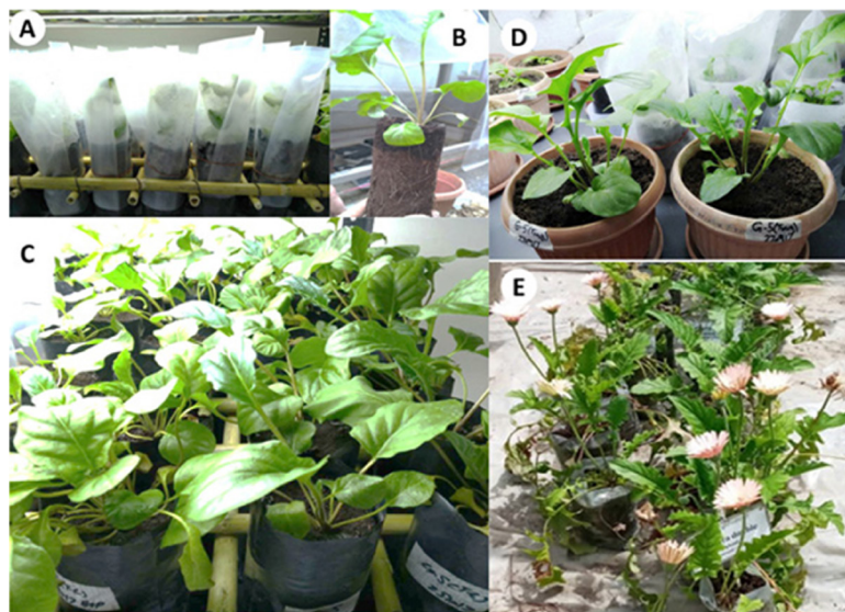
Figure 2: Acclimatization and growth of Gerbera jamesonii 'Pink Melody' A) Acclimatization in the growth chamber for three weeks, B) Plantlet with well-developed root system after three weeks in the growth chamber, C and D) Further growth of micropropagated plantlets after five and eight weeks in the greenhouse, respectively, and E) Flowering plant grown in peatmoss and soil (1:1, v/v) after 15 weeks in the greenhouse.

z Values followed by the same letter in the same column are not significantly different at P \leq 0.05 level, according to Tukey's multiple range test.