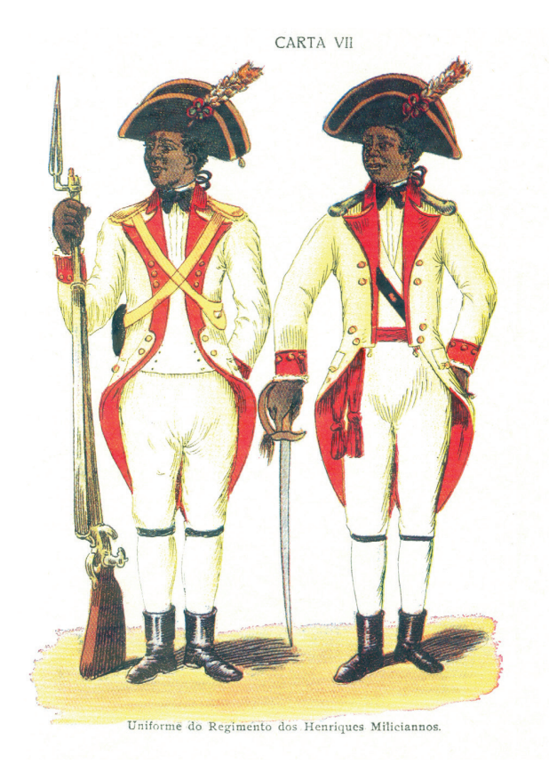
Figure 2. Uniform of the Regiment of the Henriques militiamen.

involvement in commercial affairs and the slave trade should be emphasized, as these characteristics seem to be present among other brothers in the IBJNR.