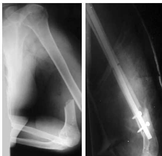
Figures 3A and 3B: Retrograde nail used for transverse fracture. A fracture occurred at the nail insertion site.

From those 27 patients, five complained about pain in the shoulder and only in one an abduction limitation was seen. Temporary palsy of the radial nerve was seen in two patients. Only one of them presented pseudoarthrosis and, 5 months following surgery, a new surgical procedure was indicated with the use of plate and autologous bone graft.