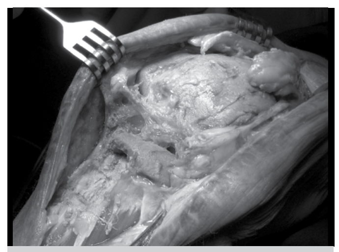
Figure 5. Appearance of case 2 after removal of the prosthesis and allograft without extensor mechanism.

After the amputation, it progressed well, with control of the infection and the patient is currently being followed up at our hospital by the Prosthetics/Amputees group.