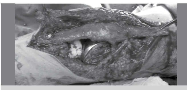
Figure 2. Allograft implanted in the tibia and fixed with screws.

maintained immobilized in extension for six weeks performing only isometric strengthening exercises and assisted passive range of motion gain. After the sixth week active exercises with progressive weight were allowed until the third month, when immobilization was discontinued.