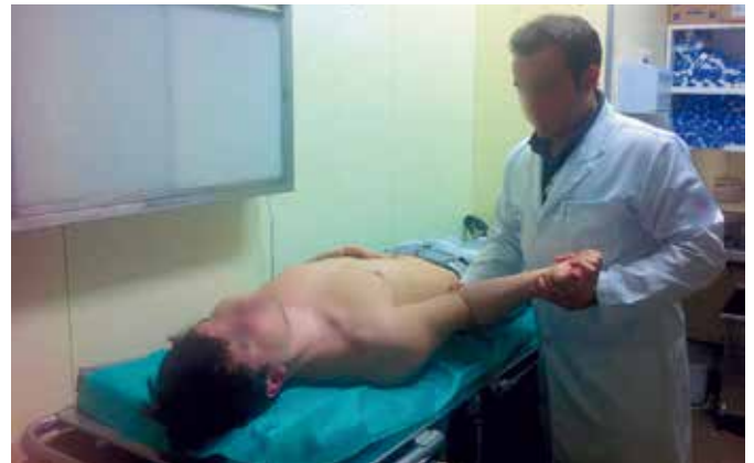
Figure 5. External rotation until resistance.