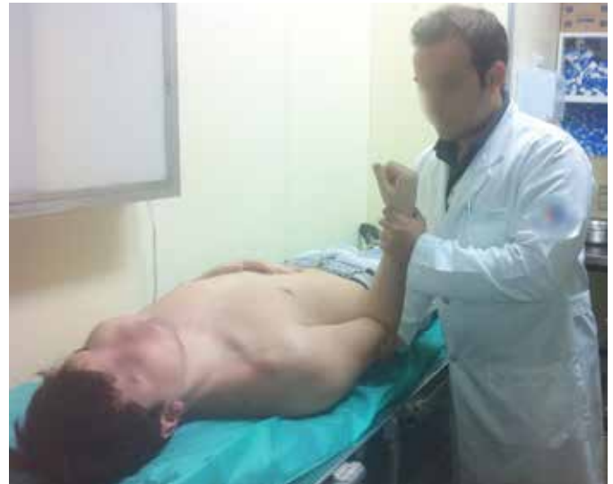
Figure 4. Elbow in adduction is flexed at 90°.