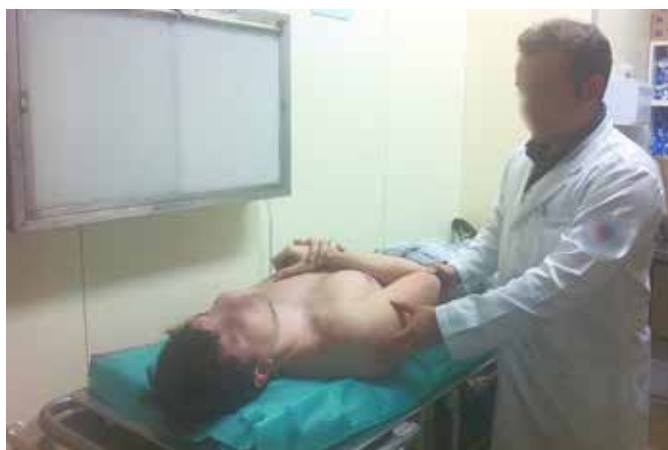
Figure 7. Extension and internal rotation of the shoulder.