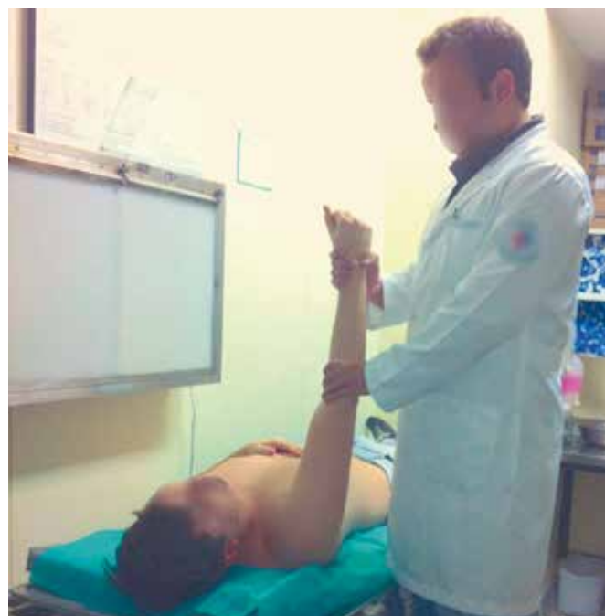
Figure 1. Longitudinal traction.

A total of 105 patients were seen by the residents of the service, during the study period, 17 having been excluded from the study: two were unconscious, six had concomitant fracture, five were on previous medication (analgesic, sedative or muscle relaxant) and in four cases not enough data was obtained. Thus, 88 patients were included in the study, 75 men (85.23%) and 13 women (14.77%), with no statistical difference between the groups. The mean age was 30.92 \pm 12.32 years old; being 30.356 \pm 9.604 years in group A and 30.954 \pm 10.961 years in group B, with no statistical difference between them. The right side was affected in 55 cases (62.5%), 28 in group A (62.2%) and 27 in group B (62.8%). Both groups were also similar regarding the time elapsed between the dislocation and the reduction, which averaged 1.316 \pm 2.067 h in group A and 2.081 \pm 1.645 h in group B. And yet, regarding the number of previous episodes, it was 3.156 \pm 3.49 in group A and 1.907 \pm 2.234 in B.