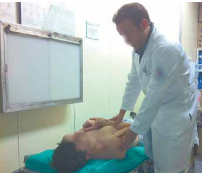
Figure 3. Internal rotation and extension.