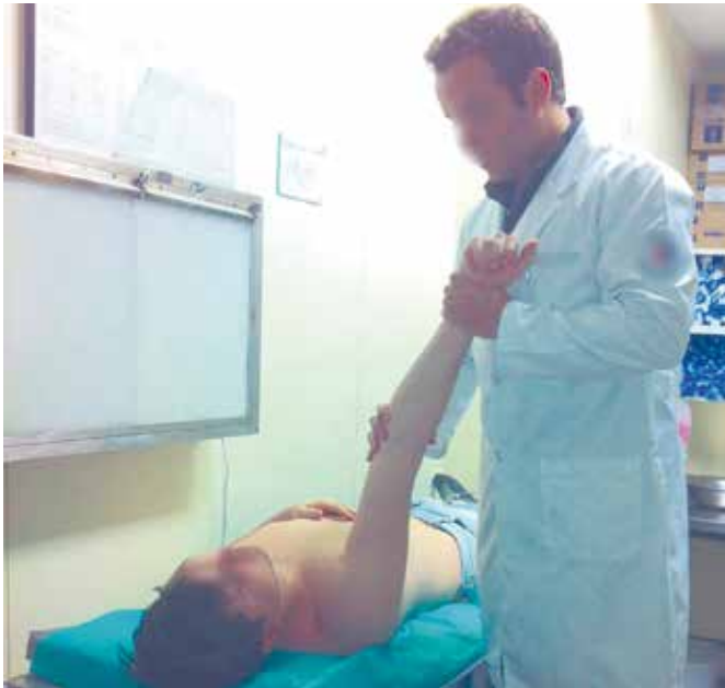
Figure 2. External rotation.