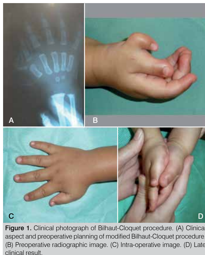
Figure 1. Clinical photograph of Bilhaut-Cloquet procedure. (A) Clinical aspect and preoperative planning of modified Bilhaut-Cloquet procedure. (B) Preoperative radiographic image. (C) Intra-operative image. (D) Late clinical result.