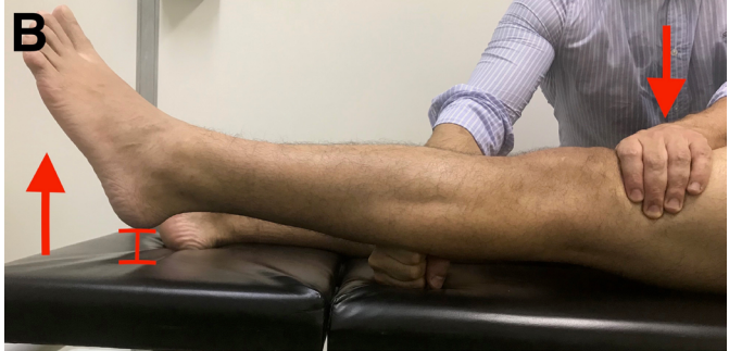
Figure 1. A: Closed fist is placed under the proximal third of the posterior leg in the resting position; B: A negative test is demonstrated.