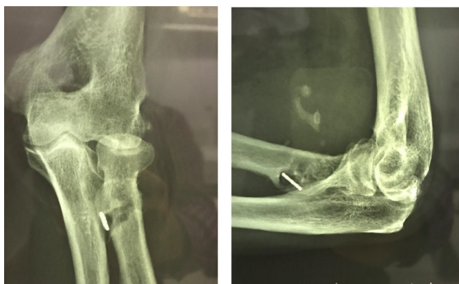
Figure 2. Osteolysis of the endobutton tunnel, with formation of heterotopic ossification in the tendon repair zone.

Regarding the follow-up of the monitored patients, the absence of pain was reported between 3 and 10 weeks, and full-load activities were authorized on average at 24 weeks. The 14 patients that underwent surgery achieved a functional range of motion, returning to their sports activities at the end of treatment, and the MEPS score was excellent in all cases. A complication rate of 21.4% (3 cases out of 14) was observed, two of which were neurological injuries (patient 11 exhibited an injury to the posterior interosseous nerve and patient 14, an injury to the lateral antebrachial cutaneous nerve with osteolysis of the endobutton passage tunnel and formation of heterotopic ossification in the tendon repair zone – Figure 2) and one (patient 4) that evolved with biceps muscle rupture.