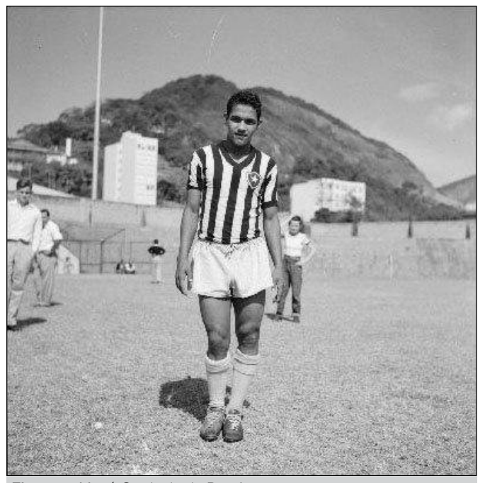
Figure 1. Mané Garrincha in Botafogo. Source: Official Twitter page of Botafogo Futebol e Regatas.<sup>20</sup>

When we think of players with deformities in lower limb alignment, the picture of the great Brazilian right-hander Mané Garrincha comes to mind (Figures 1 and 2). He was nicknamed "Crooked leg Angel" on account of his noticeable bow legs. According to Ruy Castro's accounts<sup>15</sup> and other newspaper sources,<sup>16-19</sup> Garrincha was born with bone deformities and was subsequently affected by poliomyelitis in his childhood, the sequelae of which aggravated the axial deviations of his lower limbs. His right leg was 6 cm shorter than the left, causing a medial deviation ( genu valgum ) towards the left leg. His left leg also had a similar shape, with a lateral deviation ( genu varum ).<sup>17,19</sup> As a result of that malalignment, Garrincha probably had a dislocated hip and suffered from scoliosis.