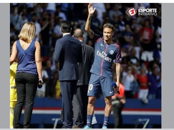
Figure 3. Neymar Júnior's debut in PSG.

Although there are not many direct reports on the subject in press sources,<sup>31</sup> one can notice in his performances in matches and training that Neymar Júnior, left-hander of the Brazilian team and one of the main players of world soccer, has a certain degree of bow leg, more noticeable in his left knee (Figure 3).