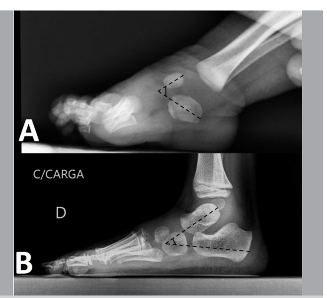
Figure 2. Illustration of the determined angle between the talus and calcaneus in the lateral incidence (Kite's angle). (A) Before treatment; (B) after treatment. When the foot is not corrected, the angle vertex is in the dorsal region. After correction, the angle should be on the midfoot, preferably on the cuboid ossification center.