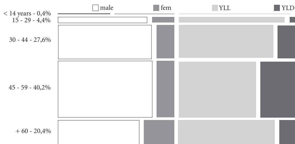
Figure 4. Proportion of YLD, YLL and DALY a cirrhosis due to alcohol and other causes, by gender, Brazil, 2008.

a DALY (Disability Adjusted Life Years), the YLL (Years of Life Lost) and the YLD (Years Lived with Disability).