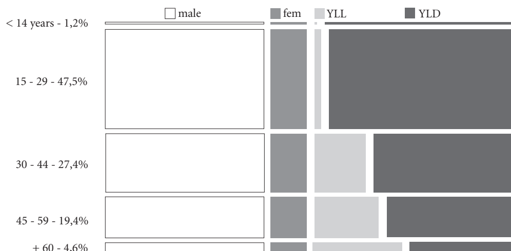
Figure 3. Proportion of YLD, YLL and DALY a for alcohol abuse and alcohol dependence by gender, Brazil, 2008.

a DALY (Disability Adjusted Life Years), the YLL (Years of Life Lost) and the YLD (Years Lived with Disability).