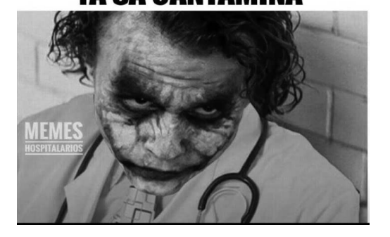
Figure 2. Nursing as a subaltern paramedical profession.