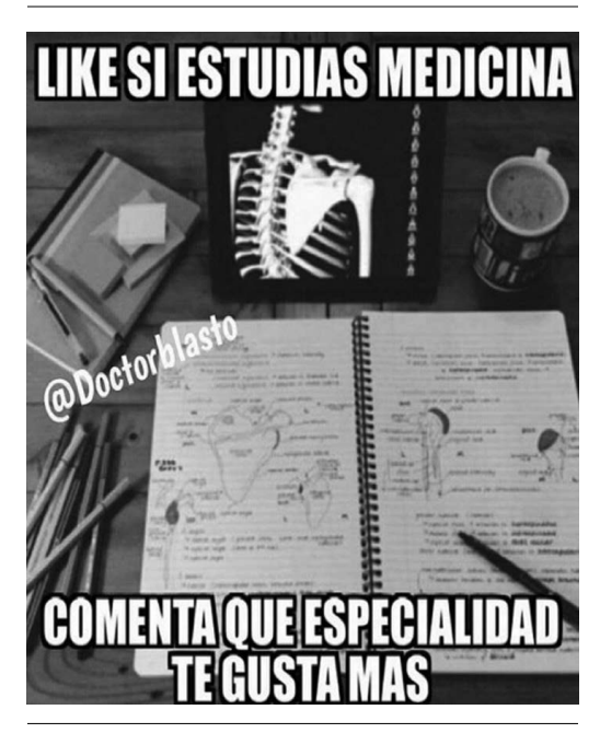
Figure 3. Specialization as the most appreciated nath

Caption: "Say Surgery" – "Internal Medicine".