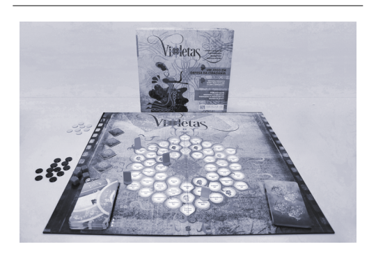
Figure 1. The board game Violets: cinema & action in combating violence against women.