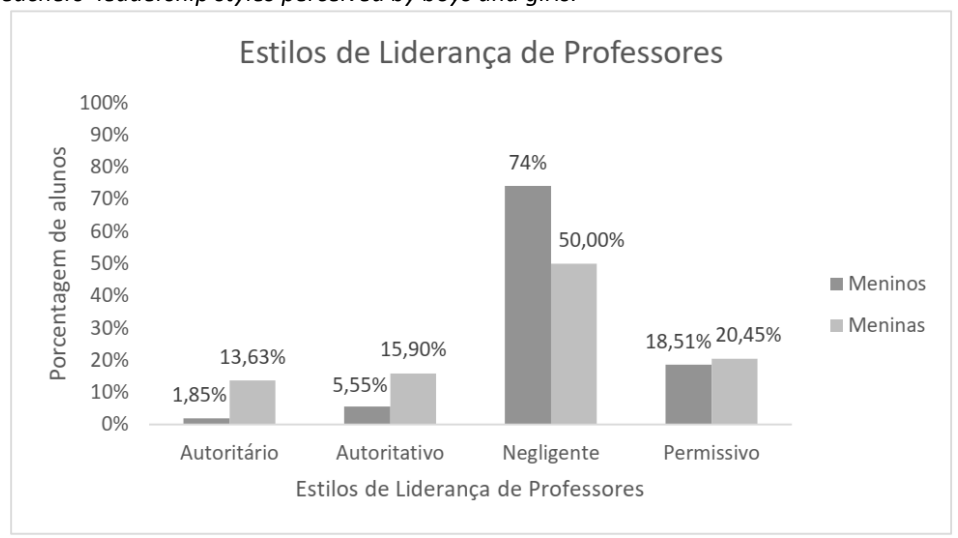
Figure 3. Teachers' leadership styles perceived by boys and girls.

Estilos de liderança dos professores: teachers' leadership styles; Porcentagem de alunos: percentage of students; Meninos: boys; Meninas: girls; Autoritário: authoritarian; Autoritativo: authority; Negligente: negligent; Permissivo: permissive