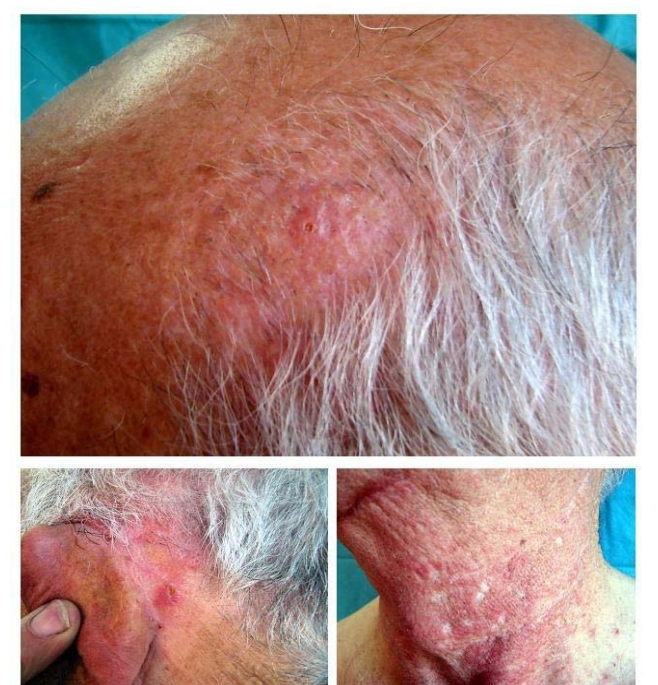
Figure 1. Ulcerated lesion of the scalp (top) and a crusted lesion of the retroauricular area (bottom left). When regressing, some of the lesions left a whitish scar (bottom right).