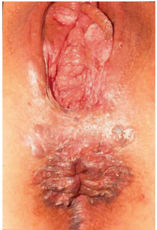
Figure 4: Patient with vulvar intraepithelial neoplasia (VIN) III and anal intraepithelial neoplasia (collection of Infectious Diseases in Gynecology and Obstetrics Sector - Department of ObGyn/Genital Lesions Ambulatory- DTG/HC-UFPR).