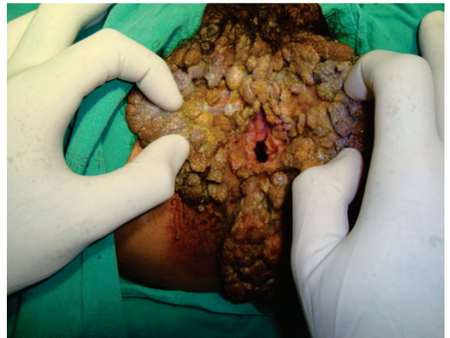
Figure 5: Extensive condylomas in vulvar and perianal regions (collection of Infectious Diseases in Gynecology and Obstetrics Sector - Department of ObGyn/Genital Lesions Ambulatory- DTG/HC-UFPR).