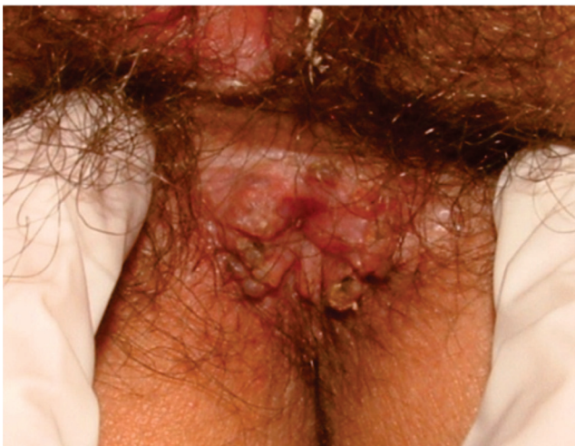
Figure 3: Pigmented area and acetowhite area (collection of Infectious Diseases in Gynecology and Obstetrics Sector - Department of ObGyn/Genital Lesions Ambulatory- DTG/HC-UFPR).

The incidence of anal cancer has increased in some specific groups and not homogeneously in the population. Thereby, findings of anal intraepithelial neoplasia tend to be more frequent in these particular groups.