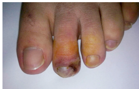
Fig. 1 – Necrotic appearance of the tip of the second toe of patient's right foot with purple to bluish discoloration.