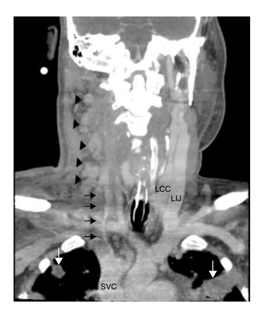
Fig. 1 – Coronal image from a contrast-enhanced neck CT scan shows thrombosis of the right internal jugular vein (arrows), multiple enlarged lymph nodes along the jugular chain (black arrowheads) and multiple focal lesions in the upper lobes (long arrows). SVC, superior vena cava.

pharyngeal exudates. He had scattered crackles over bilateral lung fields. Heart and abdominal exam was unremarkable.