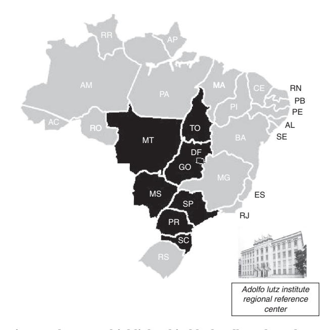
Fig. 1 – The states highlighted in black collected stool samples from patients with acute gastroenteritis, screened for rotavirus group A infection and sent to the Enteric Diseases Laboratory of the Adolfo Lutz Institute. Adolfo Lutz Institute is Regional Reference Center for rotavirus surveillance and a member of Acute Diarrhea Disease Monitoring Program with national scope.

A total of 2102 stool samples were tested. RVA was detected using commercial immunoenzymatic assays (Premier<sup>TM</sup> Rotaclone<sup>®</sup>, Meridian Bioscience, Inc., USA; or RIDASCREEN<sup>®</sup> Rotavirus, RBiopharm AG, Darmstadt, Germany) performed according to the manufacturer's instructions. RVA ELISA negative samples were tested further for the presence of RVC by polyacrylamide gel electrophoresis (SDS–PAGE) according to standard procedures, <sup>23</sup> and confirmed by RT-PCR assav. <sup>14</sup>