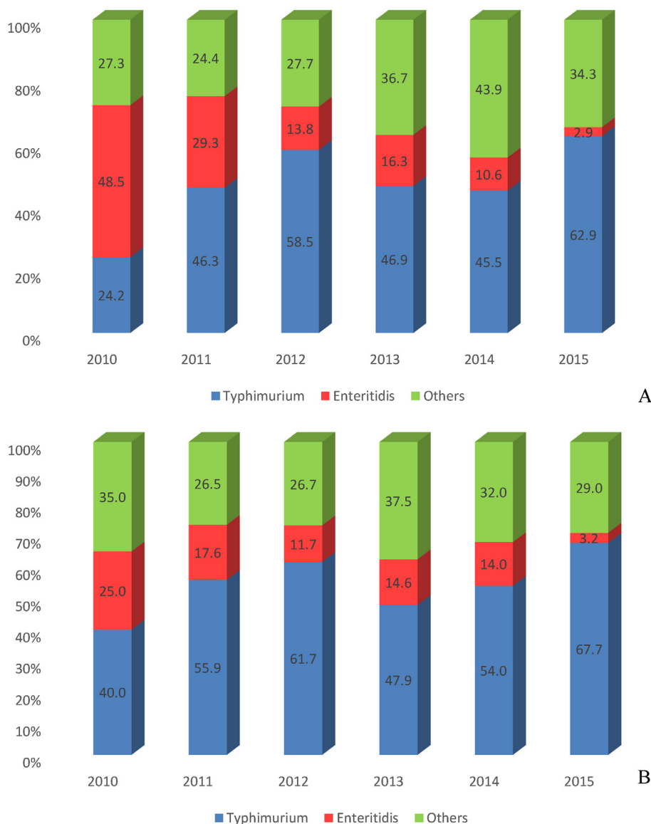
Fig. 2 – Epidemiology of human salmonellosis in southern Brazil, 2010 to 2015. (A) Salmonella isolates from all samples. (B) Salmonella isolates from hospitalized patients. The isolates were classified into three serotypes groups: Typhimurium, Enteritidis and others.

A more detailed analysis was carried out regarding Salmonella serotypes. The overall results demonstrated the