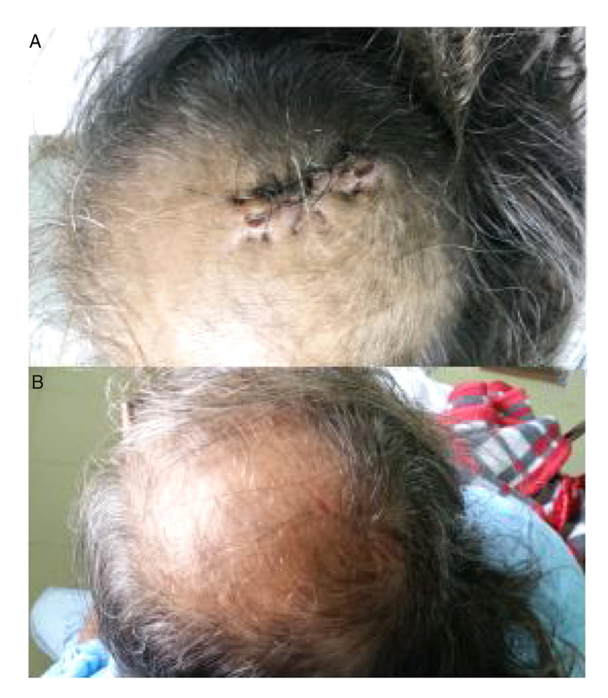
Fig. 2 – (A) One-week post-operative wound after surgical debridement of chronic skull osteomyelitis in an HIV-infected patient. (B) Three-week post-operative wound aspect.

showed 75 cells/mm<sup>3</sup> (90% neutrophils), proteins of 250 mg/dL, glucose of 36 mg/dL, negative India ink and positive cryptococcal antigen test using lateral flow assay. In bone tissue, direct fungal exam was compatible with yeast of Cryptococcus and culture showed C. neoformans (Fig. 1D). In addition, CSF culture confirmed the presence of this fungus. Chest X-ray and CT were normal. The patient received amphotericin B deoxycholate 50 mg/day and 5-fluocytosine 100 mg/kg/day. After five days, there was significant improvement of all symptoms. Nevertheless, after 15 days of treatment, the patient presented acute renal injury and anemia. Thus, his antifungal treatment was changed to amphotericin lipid complex and fluconazole 800 mg/day. Finally, after 29 days of treatment, the patient was asymptomatic and showed negative fungal cultures of his CSF, being discharged and using fluconazole 400 mg/day up to complete 10 weeks of treatment and switching to on fluconazole 200 mg/day. The surgical wound showed signs of adequate cicatrization throughout hospitalization and later on during follow up, without complications (Fig. 2A and B). One year later, the patient remained asymptomatic with a T-CD4+ lymphocyte cell count of 41 cells/mm<sup>3</sup> and undetectable viral load.