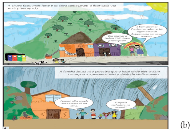
Figure 3 – art workshop activity: (a) cover of comic-book story; (b) one of its inside pages.