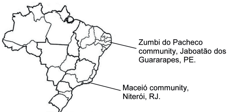
Figure 1 – Location in Brazil of areas where the educational activities analysed in this paper took place.

The two educational practices were developed in two risk areas in Brazil, namely: The Community of Maceió, city of Niterói, Rio de Janeiro Metropolitan Region; and the Zumbi do Pacheco Community in the city of Jaboatão dos Guararapes, Recife Metropolitan Region (PE) - Figure 1. Interventions took place in these two communities: in the Rio de Janeiro case, after disasters in 2010 and 2011 and, in Pernambuco on an ongoing basis over the last eight years. Communities were mobilised by institutions already operating in the area, favouring teamwork and facilitating mobilisation of the inhabitants, particularly young people. In the case of Niterói, the role of NGO Oficina do Parque (Park Workshop) was important in respect of activities it had previously run in the area and, in the case of Pernambuco, the local municipal school facilitated activities with the involvement of its teachers. Practical, educational activities were run in the two communities, such as workshops, poster making by the younger people, mock-ups, photographs, theatre and videos, as described below.