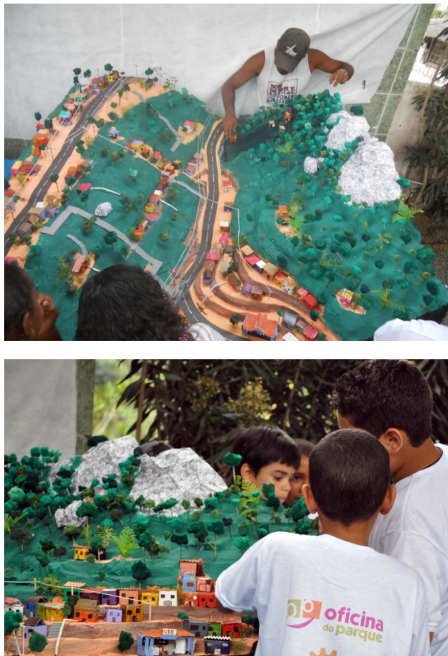
Figure 2 – Activity: construction of interactive mock-up

As an alternative to the more traditional leaflet, students attending the workshop in the community of Maceió were encouraged to create a comic-book story addressing the theme of landslides, based on a script prepared by the technical team using simplified language (Figure 3).