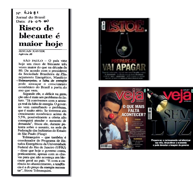
Figure 1 - Newspaper and Magazines Depicting the Energy Crisis in 2001

Left hand side: Warning about possible energy deficits that would affect economic growth. Experts accuse the government of relying on "rainfall" to ensure electricity supply; Right hand side from top to bottom: Magazine cover declaring "Prepare yourself: it is going to shut down: the economy will grow less, there will be layoffs, exports will be cancelled and inflation will grow"; Veja Magazine covers: "What else needs to happen?" Calling readers' attention to the new mandatory measures imposed on users to save energy and "Without light – get ready: rationing will turn your life into hell, slow down the economy, and it can destroy the governments' image"