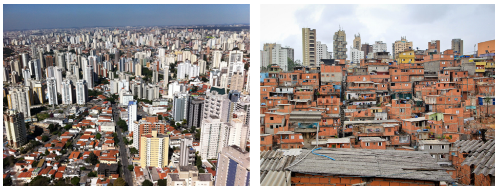
Figures 1 and 2 - Aclimação neighbourhood, with densities from 70 to 360 inhabitants per hectare (left); Paraisópolis Slum, with densities from 370 to 970 inhabitants per hectare (right)