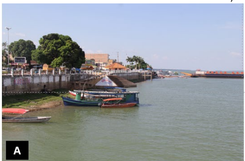
Figure 2 – Photographic representations of the front part of Itaituba County and Miritituba District.