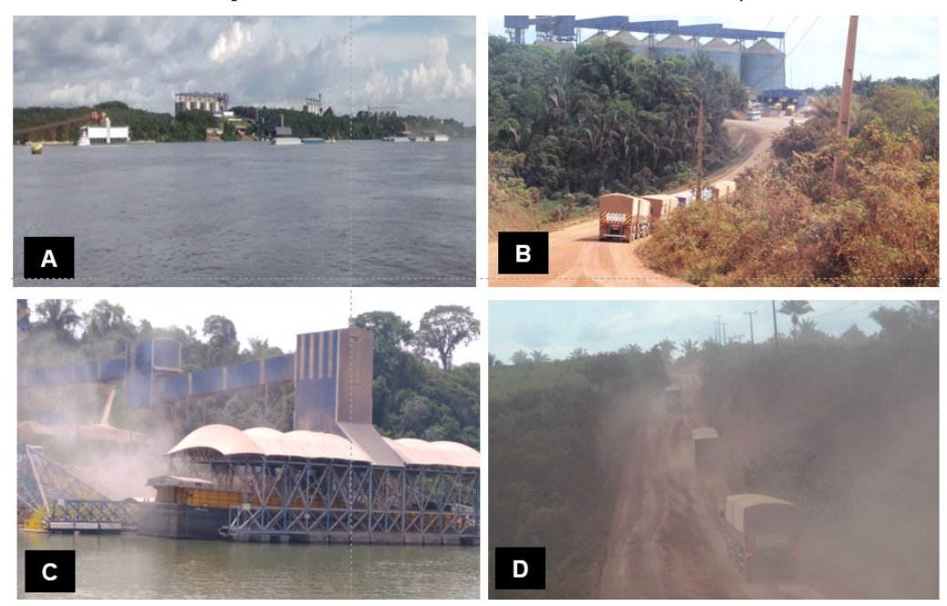
Figure 3 – Photographic representation of bulk ports and road-river transport effects on Miritituba District, Itaituba County -PA.

Reports such as this one have shown that forces capable of transforming the economy can worsen the impacts of road-river activity on social and environmental dimensions. In the case of Itaituba District (FIGURE 3), the bulk ports (A) boost the road-river activity (B), but, at the same time, they pose risks to the daily environment and expose individuals to adverse conditions. They also limit fishing activities (C); lead to unsafe traffic, due to the flow of bulk trucks; and affect the quality of the air because of intense dust (D) in the Transportuary way.