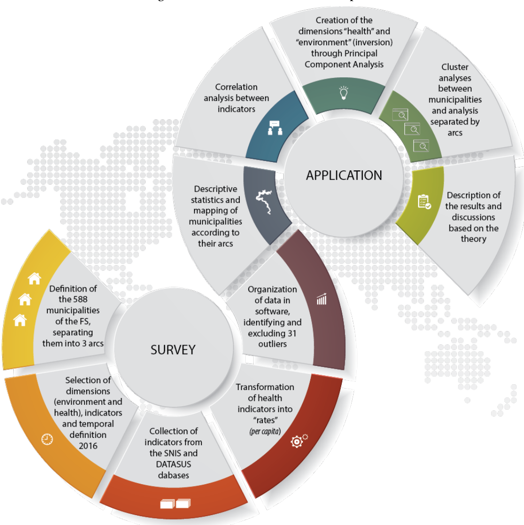
Figure 1 – Descriptive methodological framework of the stages followed in the research development