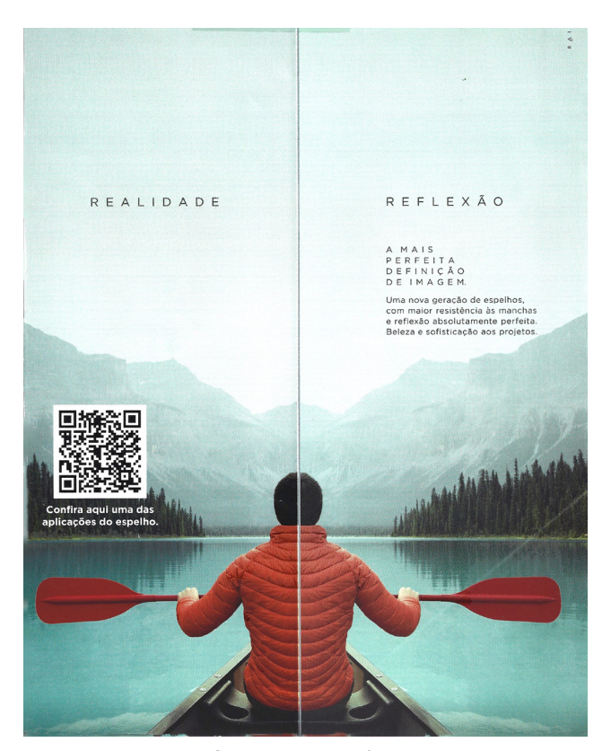
Figure 2. Image 41 of the database. (Caption: Realidade: Reality; Reflexão: Reflection; A mais perfeita definição de imagem: The most perfect image definition; Uma nova geração de espelhos, com maior resistência às manchas e reflexão absolutamente perfeita. Beleza e sofisticação aos projetos: A new generation of mirrors with greater resistance to stains and absolutely perfect reflection. Beauty and sophistication to projects).