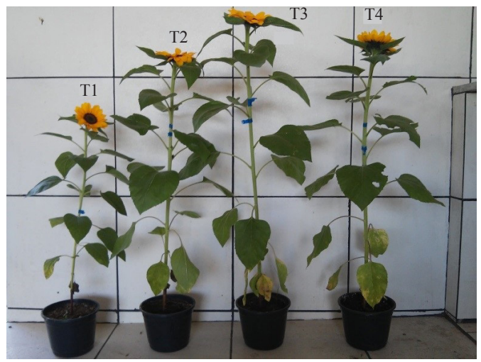
Figure 3. Plant height at harvest of cut sunflower for the different percentages of water volume applied by the Simplified Irrigation Controller (SIC), in Experiment 2 (2/3 of coconut fiber and 1/3 of soil, v/v)

became evident from the fourth week (Figure 2B), height at harvest (Figure 3), capitulum diameter and final stem diameter (Figure 2D), fresh and dry weights of shoots, number of petals, shoot/root ratio, leaf area and root volume (Table 2). Except for capitulum diameter and root volume, the increment of water led to increase in the values of the other variables up to