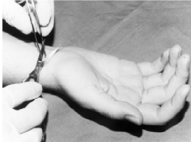
Figure 1 - Procedure for collection of a skin sample from the anterior forearm.

Even after being collected for analysis, these fibroblasts must be kept in culture until analysis completion. Alternatively, if the laboratory has a cell bank (liquid nitrogen tank), they can be frozen. In this case, culture medium is discarded and fibroblasts are washed with 0.25% trypsin-EDTA solution. After detachment from the flask, culture medium is added for freezing, i.e., HAM-F10 medium containing 10% fetal calf serum and 10% dimethylsulfoxide. Cells are then transferred to plastic ampoules and frozen at -70°C for 1 h and a half, then transferred to liquid nitrogen.