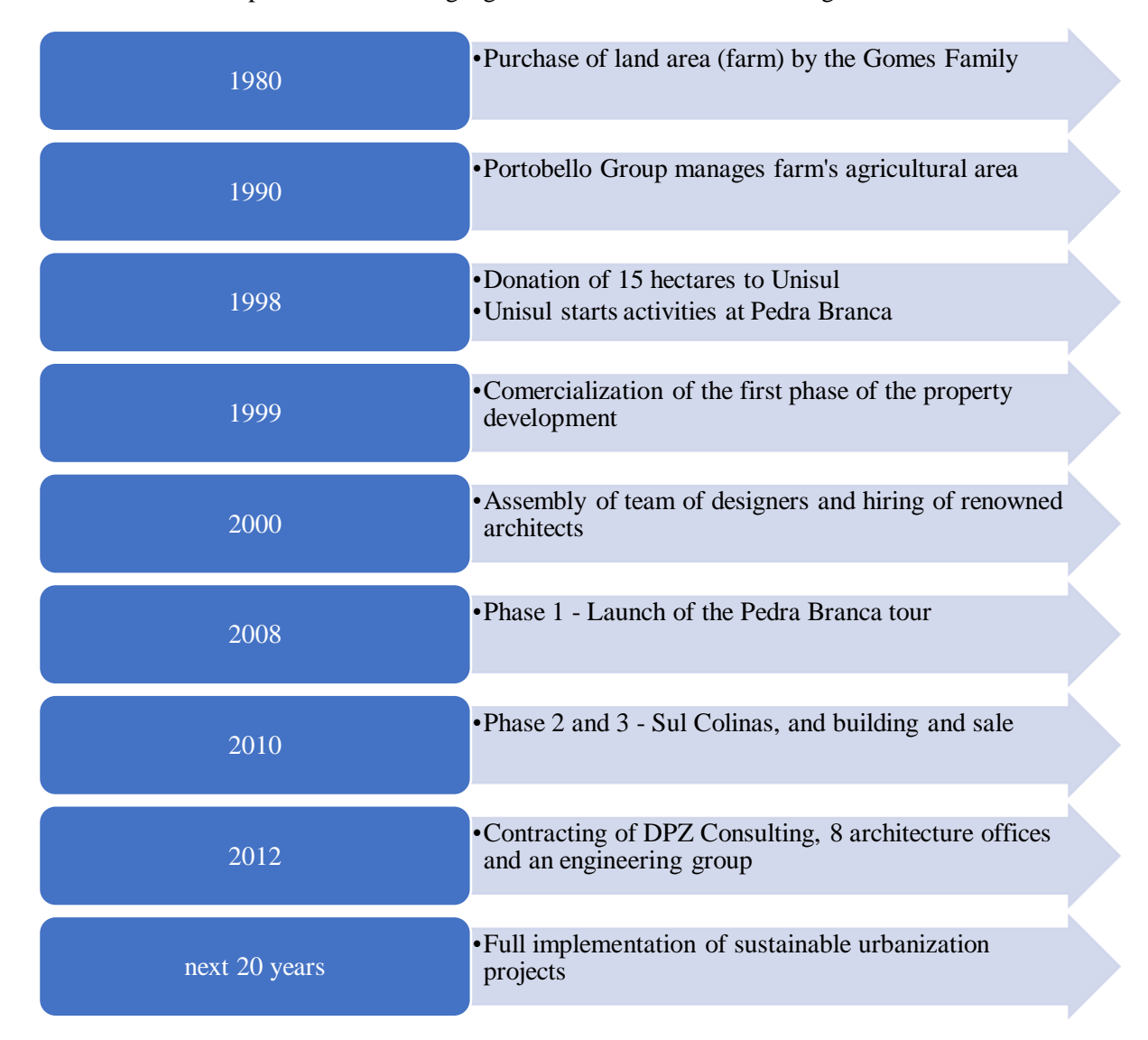
Figure 2. Events Representative of the Pedra Branca Implementation

In addition, there is investment in refuse collection and recycling. There is use of the neighbourhood management model: the concept was incorporated by the residents' association. Sustainable buildings were built. In summary, to make viable all the existing infrastructure, the Pedra Branca timeline comprises the following significant events, described in Figure 2.