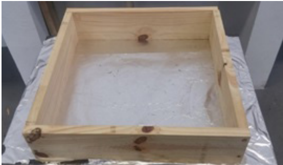
Figure 4. particle-mattress pre-pressing.