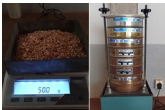
Figure 3. Particle size composition of wood particles.