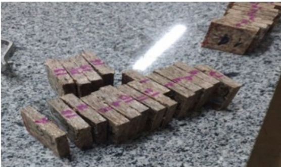
Figure 6. Aspects of specimens (a) Specimes at 100°C; (b) Specimes after 24 h at 100°C