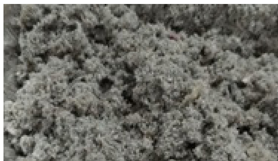
Figure 1. Leather particles used in particleboards.