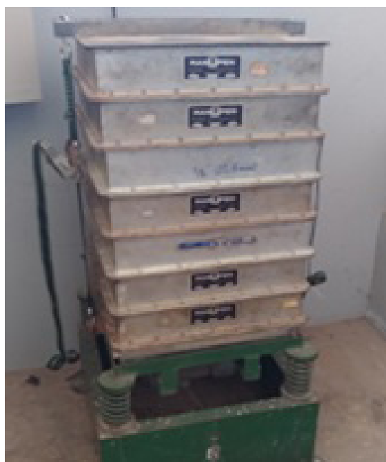
Figure 2. Mesh sieves set.