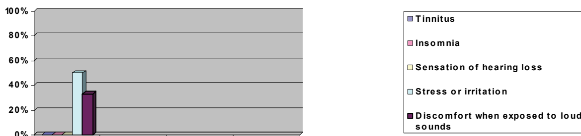
Figure 2 – with responses obtained through the questionnaire

The age range of respondents was 28-51 years old, and this item was not used as a criterion for participation in research. The analyzed group has 5-24 years of service to the company, in general, the same industry. Only 16% of subjects reported exposure to noise outside the work environment, as justifying another job, the waiter service at parties at least three times a week. Two subjects make use of ear and reported that training for the same is efficient, an employee reports using the shield, but thinks ineffective training, while three officials do not make use of ear training and complain.