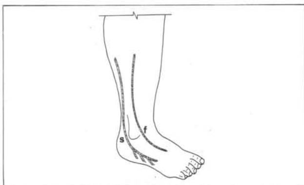
Fig.1. Schematic of the Sural (S) and the superficial fibular (F) nerves.

In spite of the follow up periods having not been long enough and the number of operated cases being small for establishing unquestionable conclusion, we feel safe to report that the termino-lateral neurorraphy between the distal ending of the sural nerve to a branch of the superficial fibular nerve is able to prevent the sensorial sequel of the sural nerve removal the post-operative morbidity and the operative time are not increased.