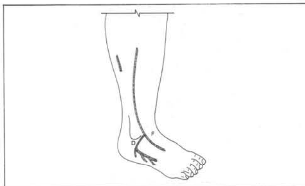
Fig.3. Schematic showing the latero-terminal neurorraphy between the distal ending of the sural nerve (D) and the superficial fibular nerve (F).